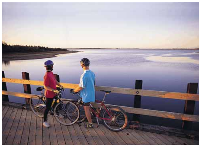
Morell