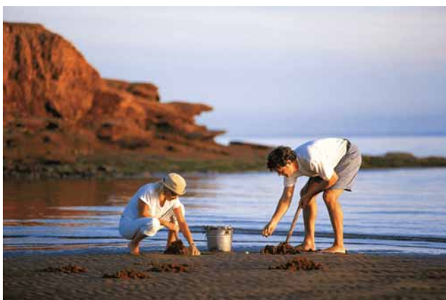
Clam Digging

The Prince Edward Island strategy for tourism competitiveness entitled The New Product Culture was developed in the spring of 2005 and presented to industry at the TIAPEI AGM on November 25, 2005. Although the strategy has only begun to take shape, the Tourism Advisory Council (TAC), Tourism PEI, TIAPEI, ACOA and other industry stakeholders have been working on key action items. This report card will outline both the quantitative and qualitative progress made in 2005.